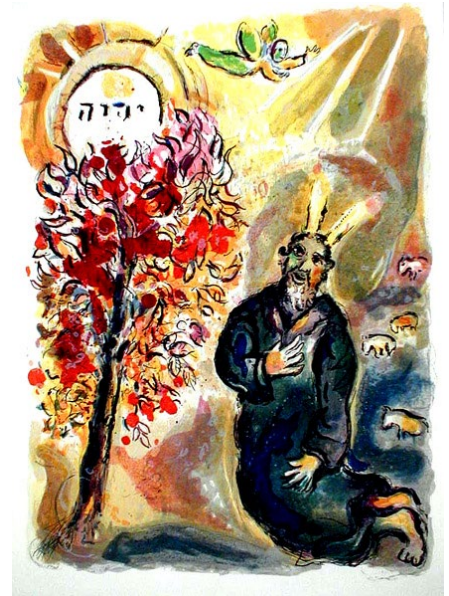
Chagall. Exodus: Moses and the burning bush. 1966

The Surtz Lecture is co-sponsored by: the John Cardinal Cody Endowed Chair in Theology, the Hank Center for the Catholic Intellectual Heritage, and the Theology Department